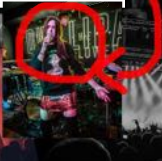
PHOTO OF DUA LIPA PERFORMING IN THE SUNFLOWER LOUNGE IN BIRMINGHAM. GRASSROOTS VENUES LIKE THIS ARE ESSENTIAL IN MUSIC SCENES AS MOST BIG NAME ARTISTS START OUT IN VENUES LIKE THIS. THEY NEED TO BE SUPPORTED.

SUCCESSFUL BRITISH ACTS INCLUDING ED SHEERAN, DUA LIPA AND SAM SMITH HELPED EXPORTS OF UK MUSIC SOAR IN 2018 TO £2.7 BILLION